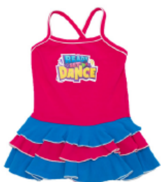
TUTU FRILL DRESS

All READY SET DANCE and READY SET BALLET students will be required to wear the official uniform that we are sure you will love. Below are the following options that can be purchased at reception.